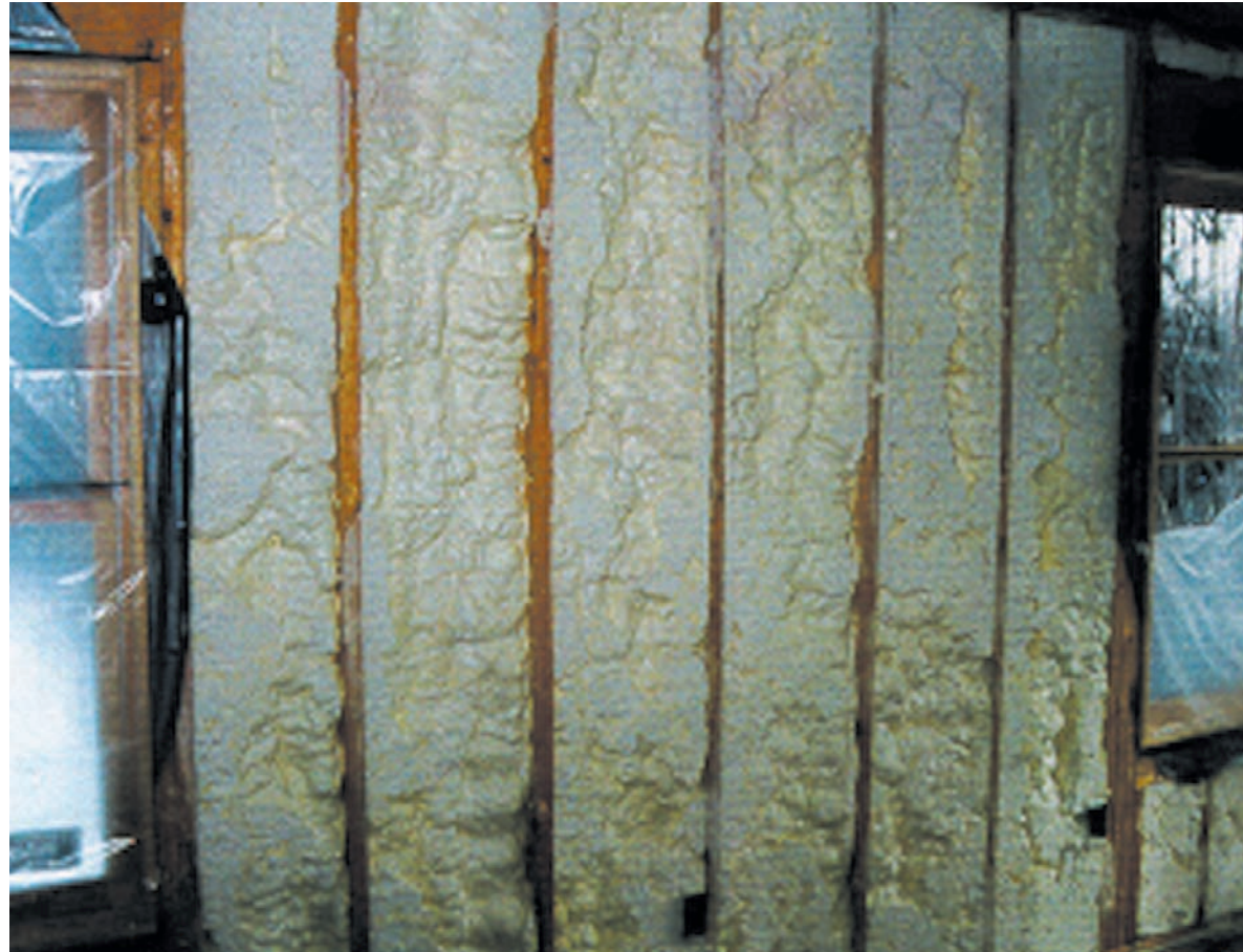
With Icynene® you rest comfortably knowing every nook and every cranny is perfectly air-sealed.

penetration is effortlessly air-sealed. No more random air leakage or energy robbing drafts to worry about. It adheres to everything - so whether you plan to build with wood or metal, Icynene® will deliver the performance you can count on.