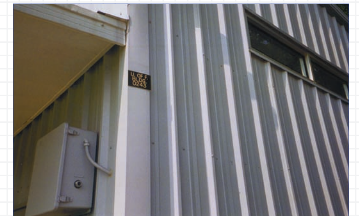
The building utilized standard corrugated steel panel construction.

This project was a collaborative effort between the University of Florida/Energy Extension Service (UF/EES), the Florida Solar Energy Center (FSEC), and the University of Florida/Soil and Water Science Department.