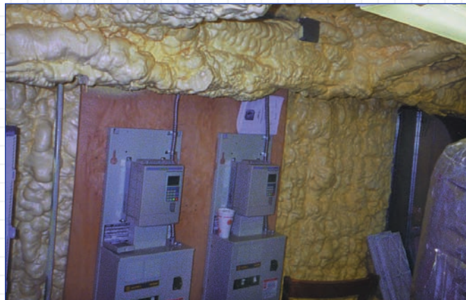
The Icynene® foam was left exposed in the mechanical room, which is located in the upper area of the building.