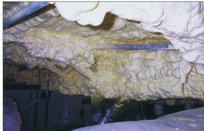
Beams and purlins were covered in Icynene® to ensure there was no conductive heat transfer from the metal roof.

The original renovation plan specified 7 low e double-pane windows. These windows were calculated as not cost effective for this particular project – payback period was 15 years. The building was completed using 7 single pane clear windows with aluminum frames.