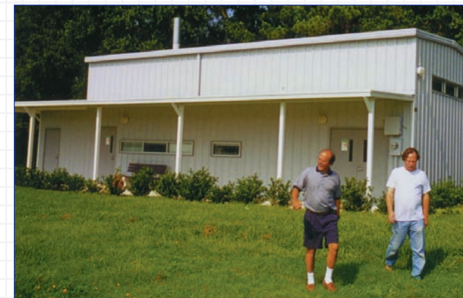
Building 243 at the University of Florida.

The building envelope for this laboratory was a typical commercial steel panel style construction. Controlling air infiltration in this type of structure is difficult at best.