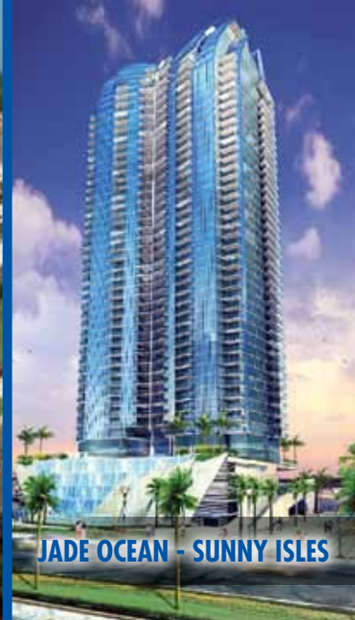
JADE OCEAN - SUNNY ISLES