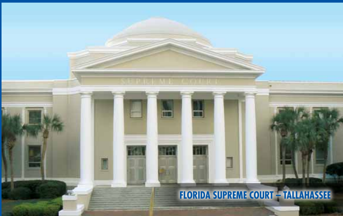
FLORIDA SUPREME COURT – TALLAHASSEE