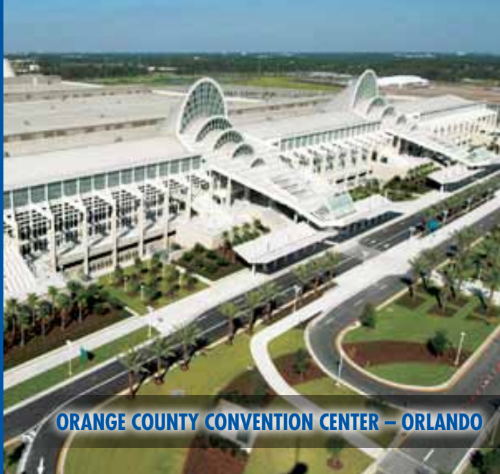
ORANGE COUNTY CONVENTION CENTER – ORLANDO

By specializing in the installation of foam insulation, we can guarantee the highest quality workmanship on your projects. Our experts in each function of the planning, bidding and building process can assist you in every phase of construction. Tailored Foam of Florida, Inc. often serves as a liaison between the contractor and architect for value engineered projects. Our staff also includes a licensed Florida General Contractor (CGC #018512).